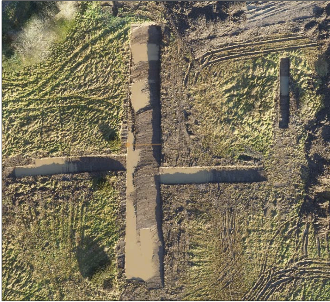
Figure 1: Orthophotograph from drone survey showing the archaeological trenches excavated in the area of DU014-006002 in Newtown, Dublin Area Logistics Park from S.